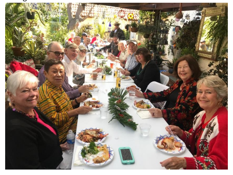
At the December holiday party

fortunate enough to enjoy mild weather compared to the rest of the nation, sometimes we have a rare frost or two. Some of the less cold tolerant broms (especially any of the Ae. chantinii forms) need some protection, whether it's placing those plants under an overhang or simply covering them with a sheet. Your plants should be fine if you have fiberglass panels. Whatever you do, don't cover with black plastic, having learned that the hard way. What methods do you use to protect your plants? Do you leave water in the cups of the tank bromeliads? Or is it a matter of "survival of the fittest?" Inquiring minds want to know. Meanwhile, happy and safe growing.